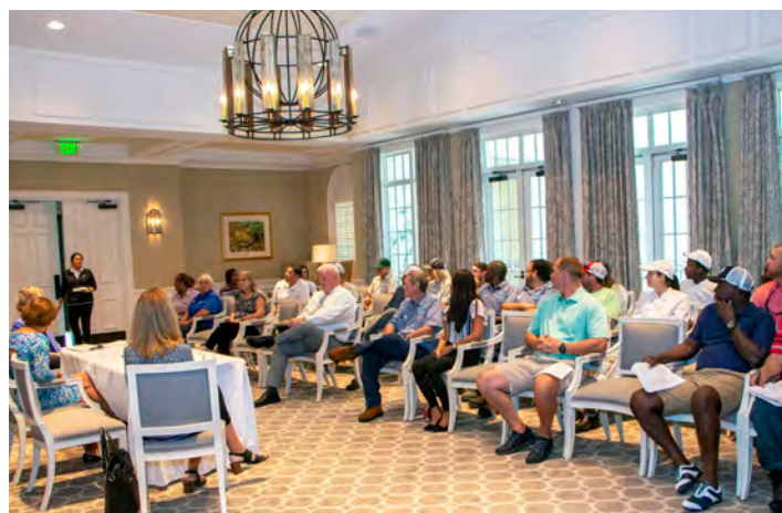
JICSL Scholarship Information Session

Scholarship Foundation of Indian River County. Our final thanks are to you, our extremely generous club members, whose philanthropy has allowed this program to excel and expand.